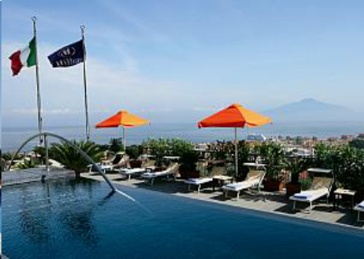
Roof Top Swimming Pool