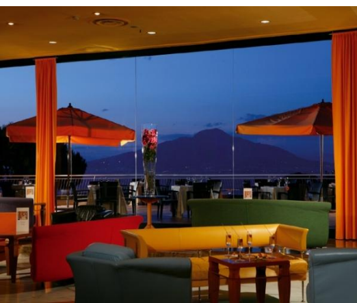
Sorrento Lounge & Bar