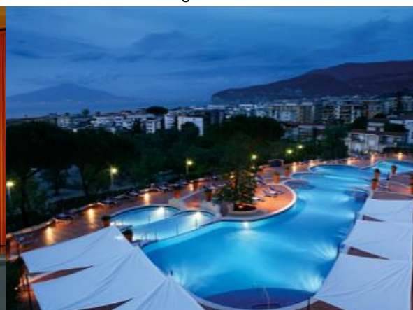
Outside Swimming Pool