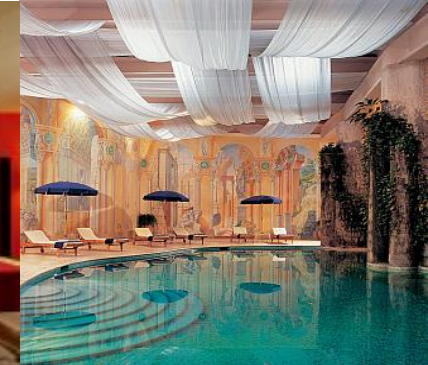
Inside Swimming Pool