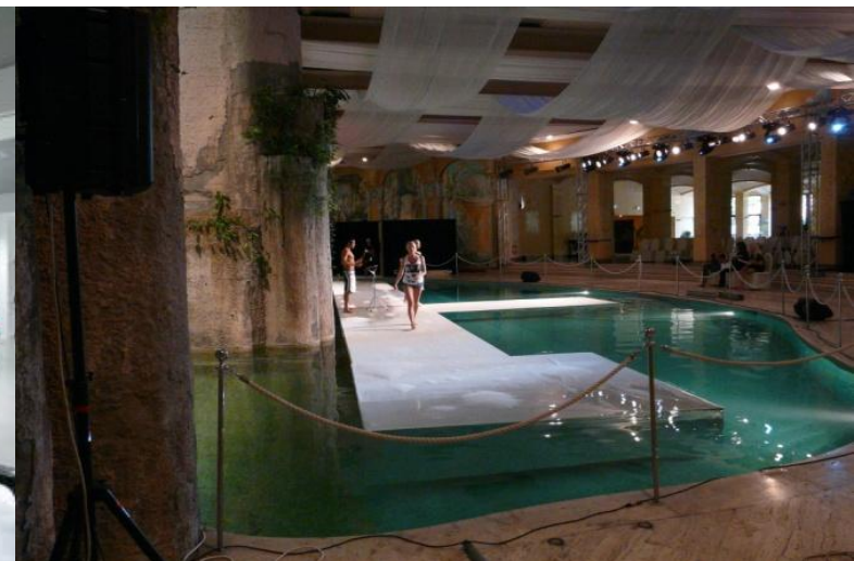
Le Ginestre with runway