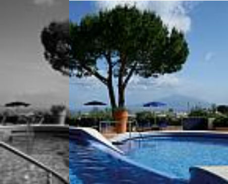
Outside Swimming Pool